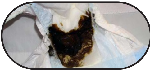
Black, sticky stools