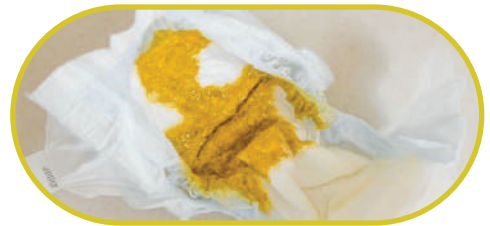
Yellow stools (can also look seedy or watery)

They should have 4-5 clear, wet diapers per day by Day 4 of life. One wet diaper is the weight of 3 tablespoons of water in a clean diaper.